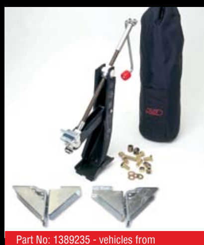
Part No: 1389235 - vehicles from 1601 kg - 2000 kg