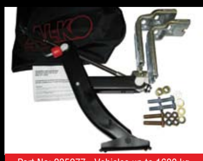
Part No: 235977 - Vehicles up to 1600 kg