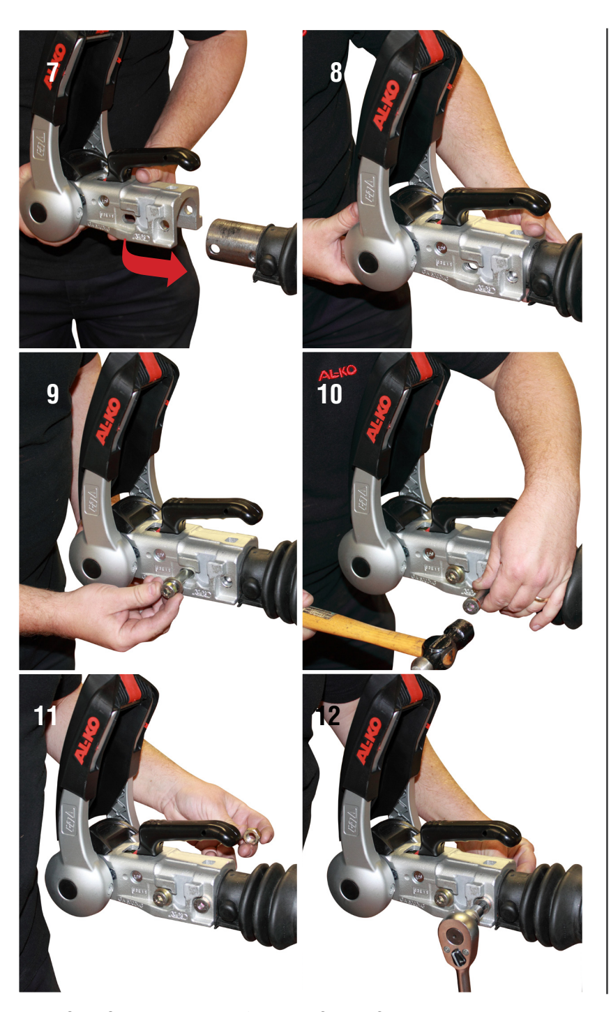
This HOW TO guide is suitable for the AKS 3004 Stabiliser, and is applicable to both the red (original) and black (new) versions.